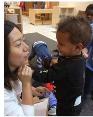
feeling a vibration

We are surrounded by sound all the time. Sound has importance in our classroom life and plays an important role in our lives.