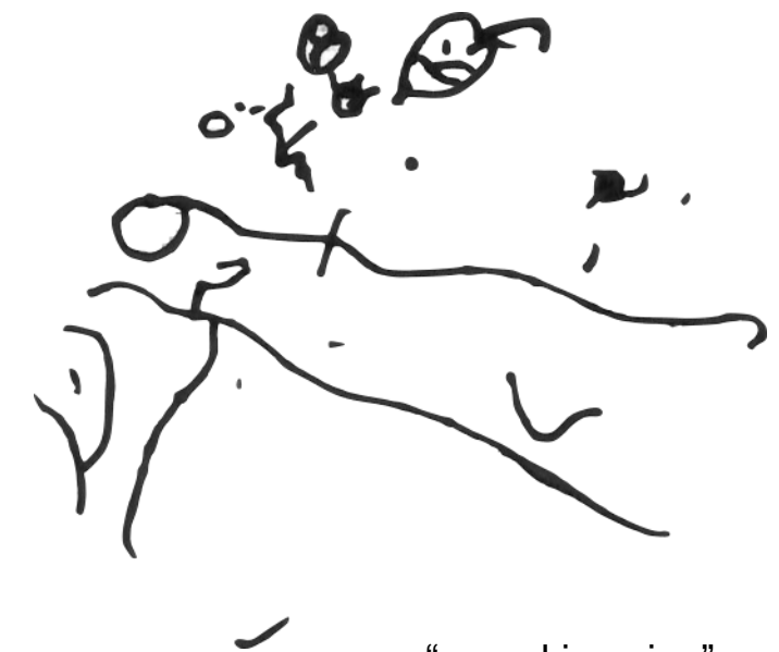
“sound is going”