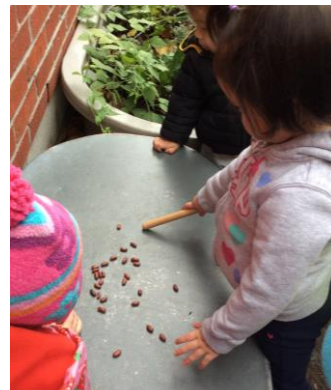
beans on metal