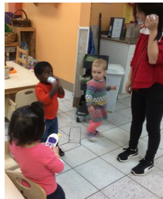
home made phones